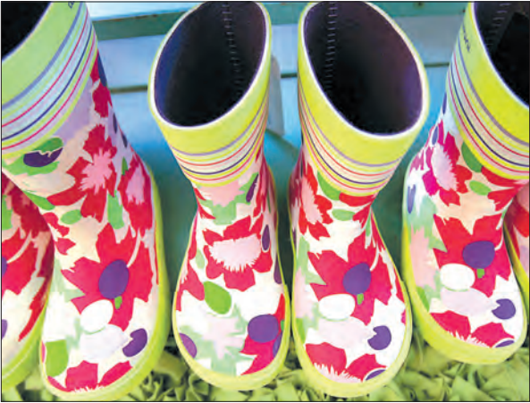
The owner of Izzy and Ash created a kids boutique that's fun, funky and age-appropriate, page 9