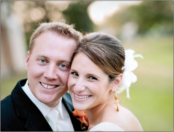
UT grads kept their long courtship Austin-casual until they finally tied the knot, Texas-style, page 8